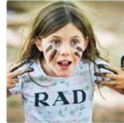
CAMOUFLAGE & CONCEALMENT